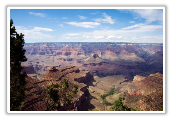
The Grand Canyon