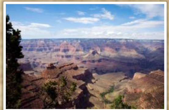
The Grand Canyon