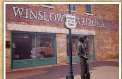
Standin on the Corner...